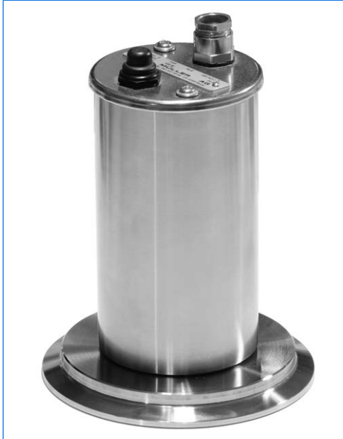
Sightglass light fitting type KLR 20 HDAsp, 20 W, 115 V, with built-in momentary push-button "D", on metal fused sightglass for Triclamp fittings, DN 100

for sterile applications in safe areas, series KLR A / KLR A PowerLED in stainless steel, for mounting onto metal fused sightglasses