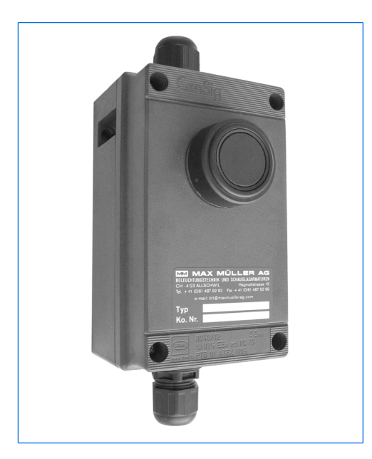
Timer type U3-230, housing in glass fibre reinforced polyester resin, nominal rating 230 V AC