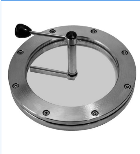
Circular sightglass, DN 150, PN 0, with glass disc in sodium silicate to DIN 8902 and wiper of the series W, wiper blade in silicone