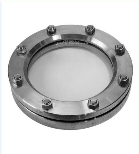
Circular sightglass similar to DIN 28120, DN 150, PN 2,5, with glass disc in sodium silicate to DIN 8902