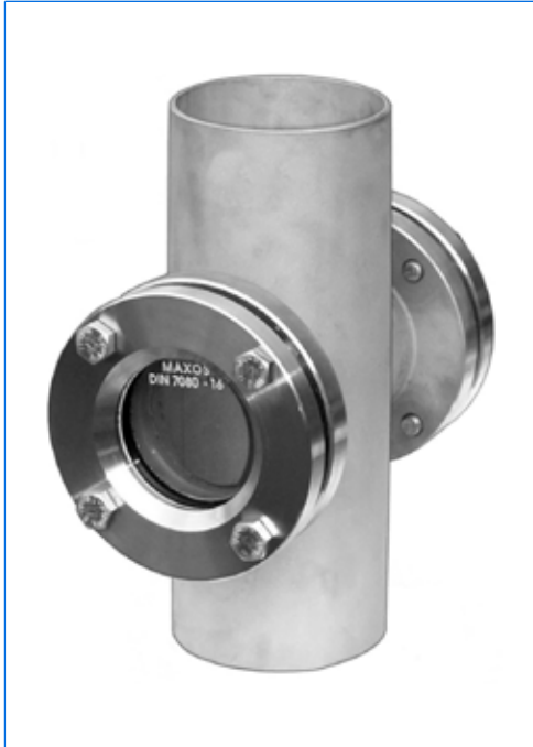
Sight flow indicator, series S-VA, type S-VA 80