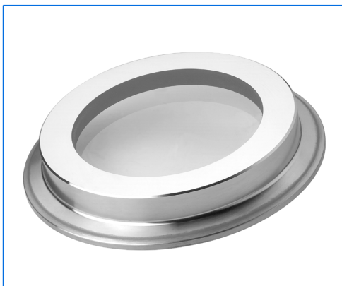
Metal fused Triclamp sanitary sightglass fitting, type "Large View" (LV)