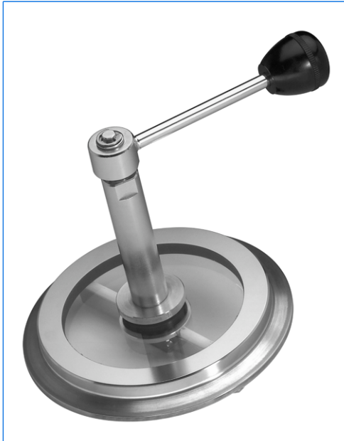
Sightglass for Triclamp fitting with built-in wiper, series WD